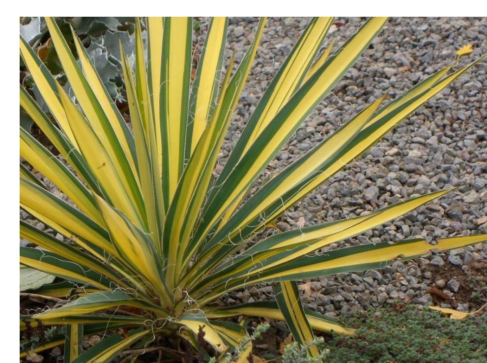
Color Guard Yucca