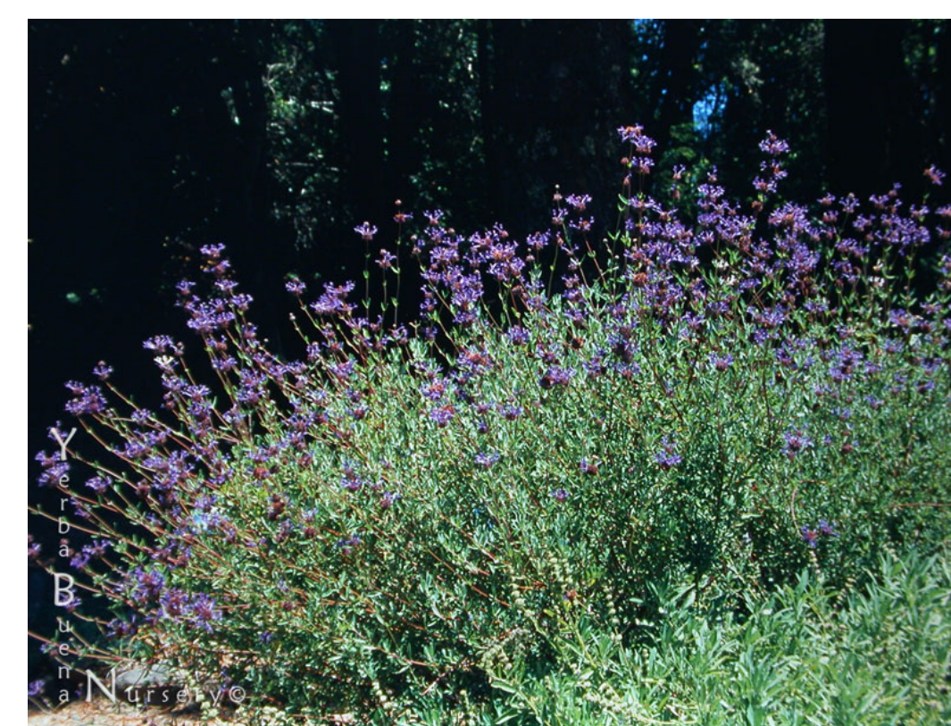
Winifred Gilman Sage