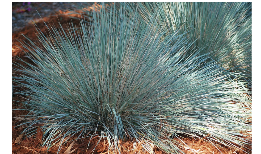
Blue Oat Grass