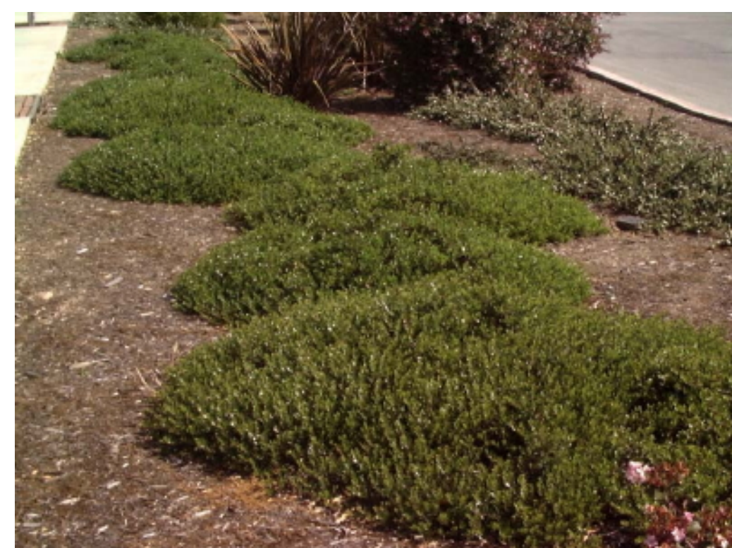
Emerald Carpet Manzanita

Ground cover completes the pedestrian outdoor room and also acts as an environmental catchment for storm water and debris. Other low water use options not shown below include– Lantana, Coyote Brush, Gazania, Germander, Juniper, and Myoporium.