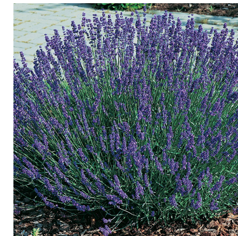
Hidcote Blue Lavender

As named, accent plantings accentuate and highlight themselves at focal points to break up the monotony and give character and identity to the streetscape. Other low water use options not shown below include – Fortnight Lily, Fan Flower, and Society Garlic.